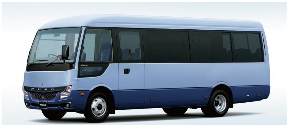
2018 model year Rosa light bus

The 2018 model introduces the first new face for the Rosa since 1997. The design language integrates the “Fuso black belt” a design element that enhances the “FUSO” logo and signifies the new brand identity of upcoming Mitsubishi Fuso vehicles. Further, the 2018 Rosa features optimized headlamps and new style LED fog lamps available on certain Rosa models.